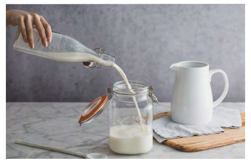
Add milk to kefir grains and store in the fridge.