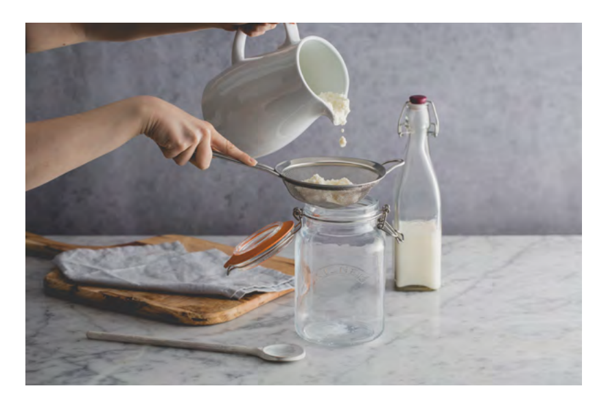
Push through a sieve to remove the kefir grains.