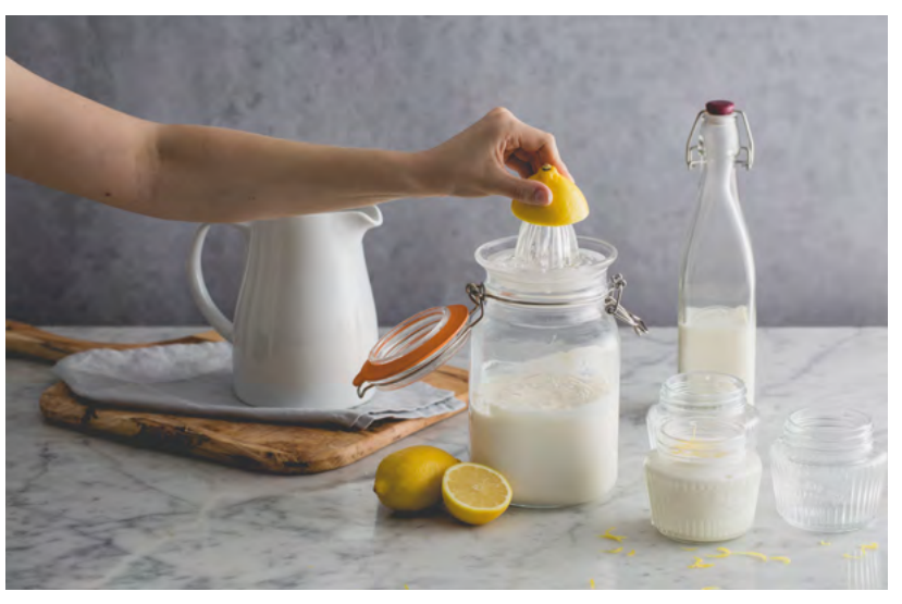
Add flavouring of choice and store in the fridge for 7days.